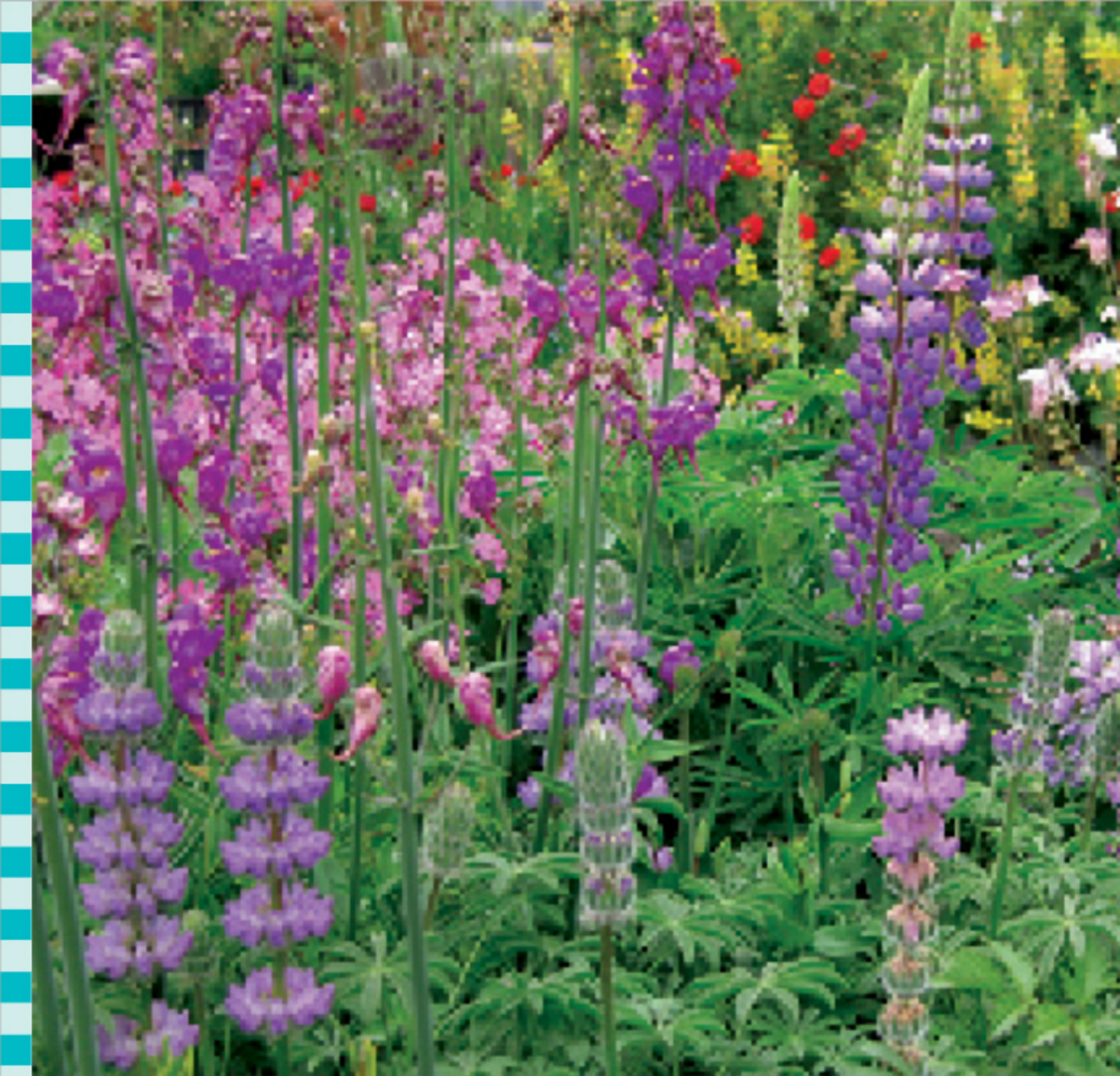
Vertical spikeage with Lupinus species 'Australia' (pg. 31) and Linaria triornithophora "Three Birds Flying" (available online).