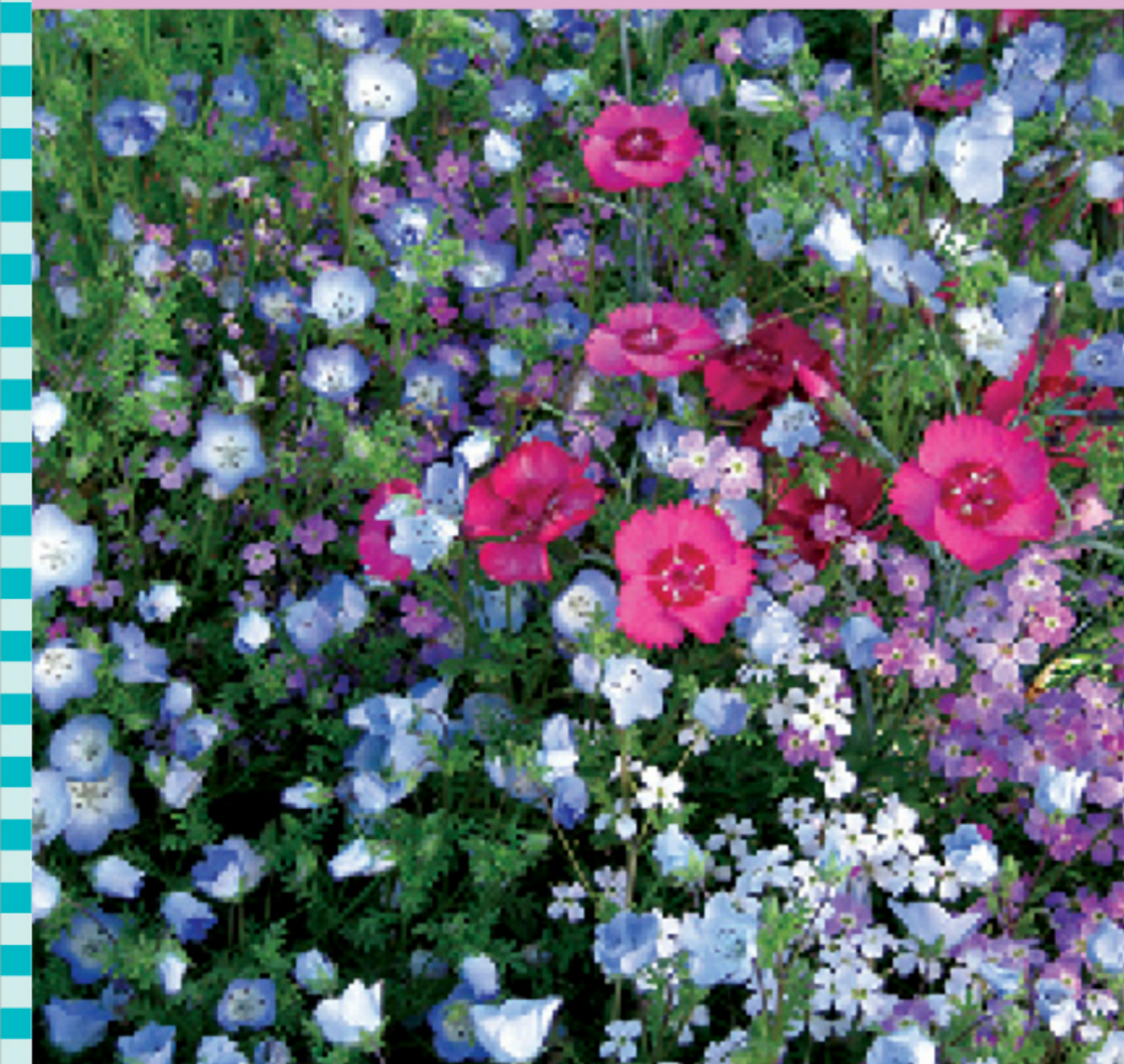
Planting close together so no soil shows and flowers intermix is a cottage garden trademark. Seen here: Nemophila menziesii "Baby Blue Eyes" (pg. 5), perennial Dianthus gratianopolitanus (pg. 20) and Malcomia maritima (pg. 6).