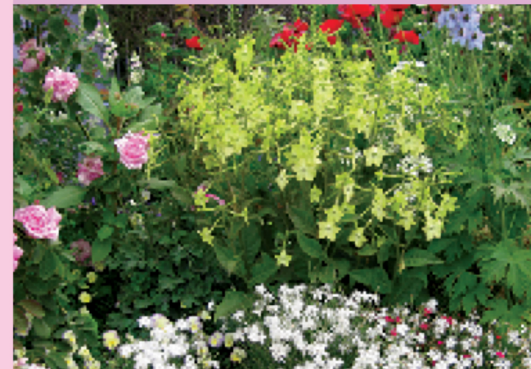
Combine your pink roses with Nicotiana alata 'Lime Green' (pg. 27) and underplant with fragrant frothy Dianthus arenarius (pg. 5).