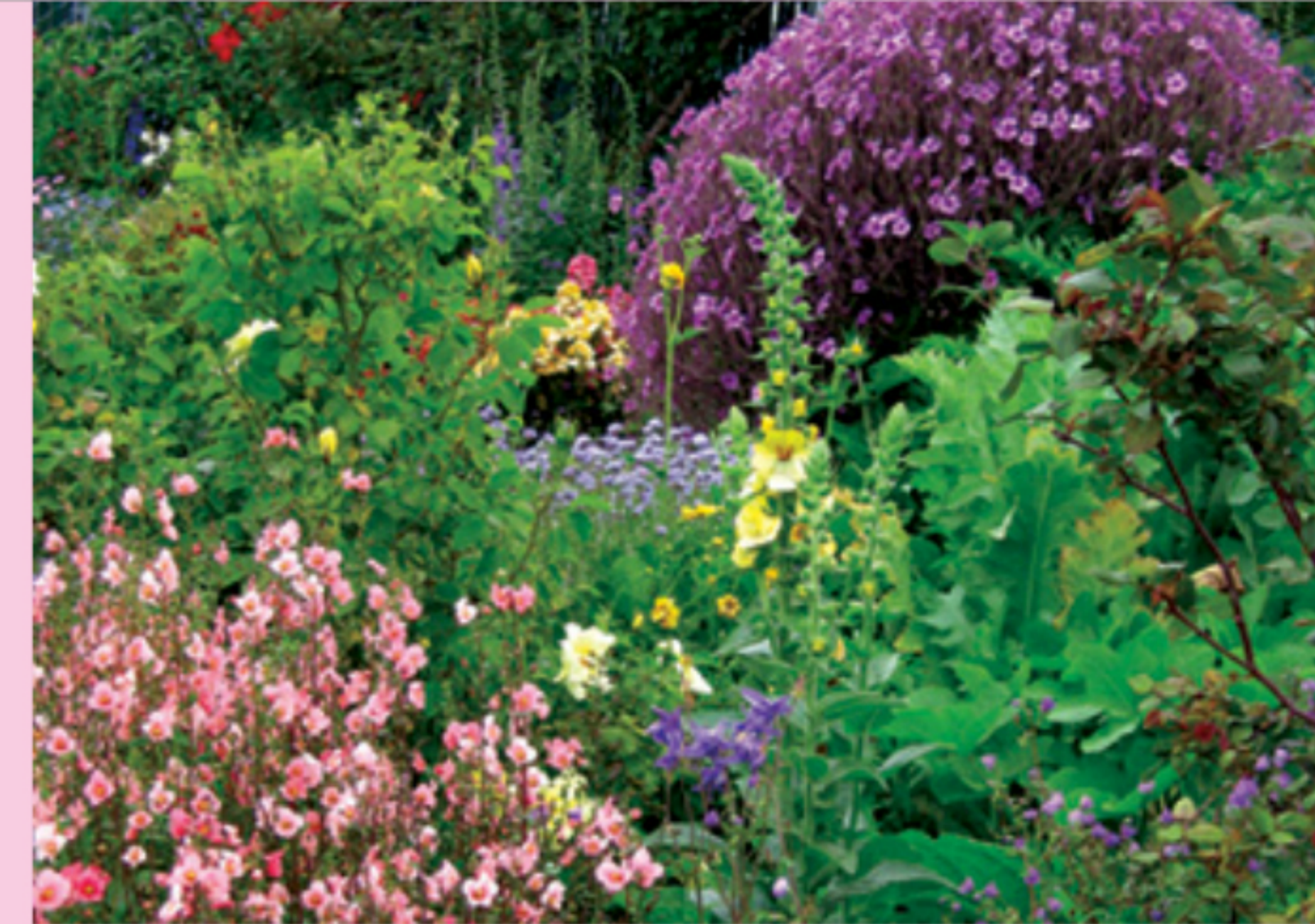
When you group so many different plants together, something is always in bloom! Foreground: Alonsoa meridonalis 'Apricot' (pg. 26). Background: Geranium maderense (available online).